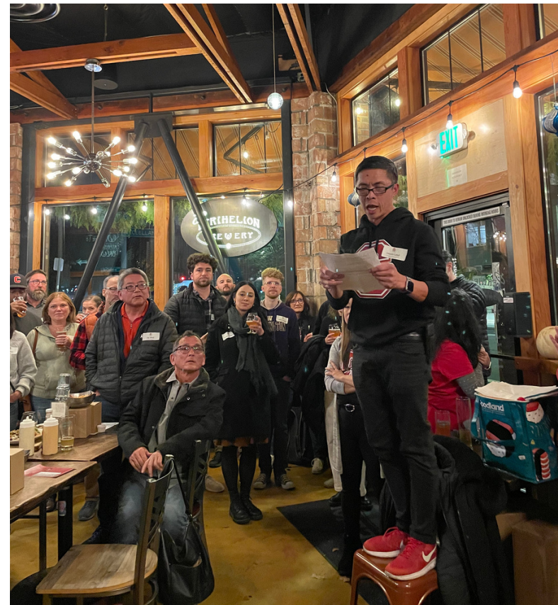
Sold Out Cleveland Pint Night