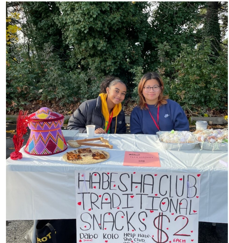
Successful End of Fall Festival